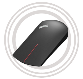
ThinkPad® X1 Wireless Touch Mouse

Wirelessly connect and expand the function of your device