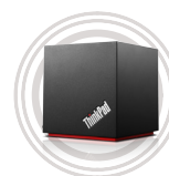
ThinkPad® WiGig Dock

Superior sound quality with a comfortable fit