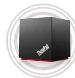
ThinkPad® WiGig Dock

Superior sound quality with a comfortable fit