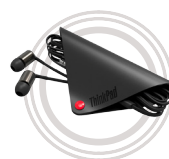
ThinkPad® X1 In Ear Headphones

Superior sound quality with a comfortable fit