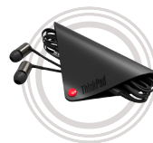
ThinkPad® X1 In Ear Headphones

Superior sound quality with a comfortable fit