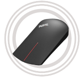
ThinkPad® X1 Wireless Touch Mouse

Wirelessly connect and expand the function of your device